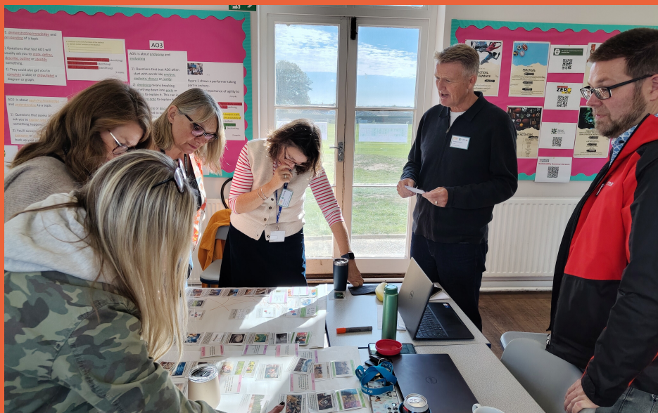
Some of the participants of the Our Schools, Our World Programme taking part in Climate Basics Training