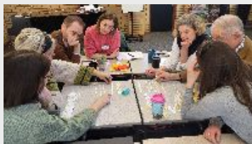
Our Schools, Our World Sustainability Programme for Primary Schools