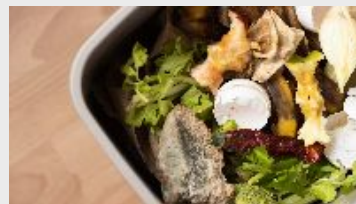
Waste Suffolk Sustainable Schools Network Meeting